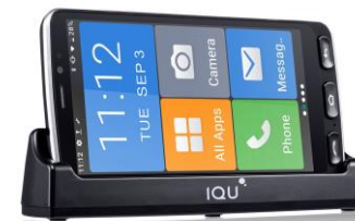
Charging Cradle included